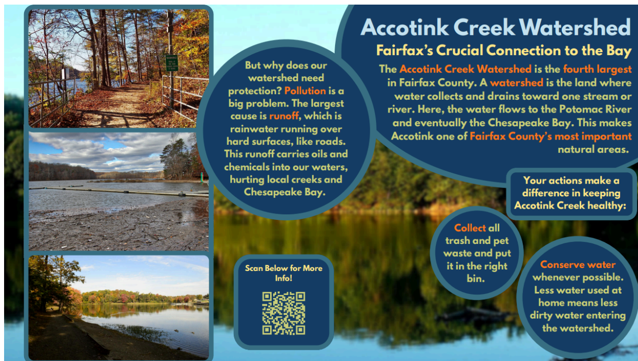
Accotink Creek Watershed Sign Mockup