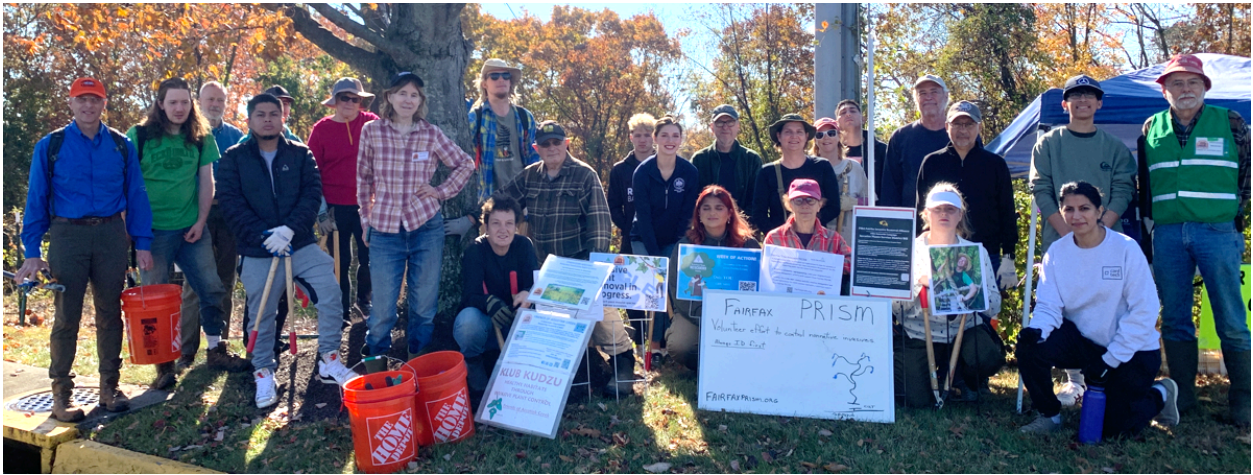
November 8 th in the Accotink Gorge