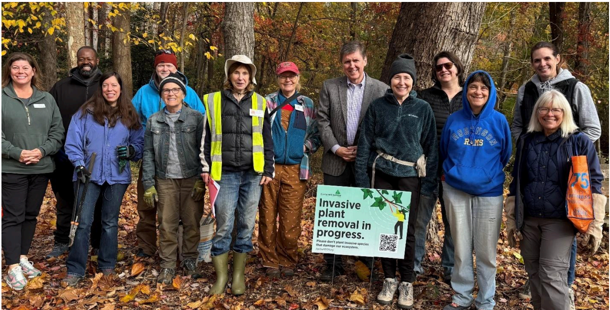
November 10 th at Southside Park

Dave stated that PRISM is fundraising to initiate a program through the Department of Forestry. FACC agreed to provide $1500.00.